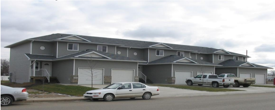
Good #2: 2-Storey Townhouse - 2 End Rows & 2 Inside Rows