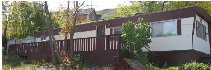
Fair #3: 8'x34'