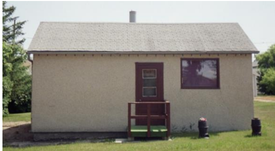
Very Low #3: 1-Storey