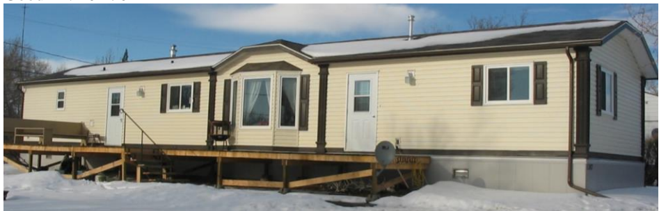
Good #3: 20'x76'