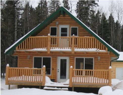
Average #2: 1 1/2-Storey