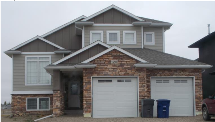
Very Good #1: Bi-Level