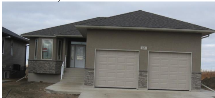
Good #2: 1-Storey