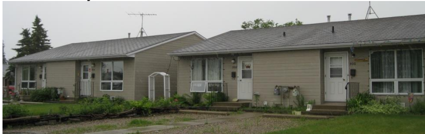
Fair #3: 1-Storey Semi-Detached