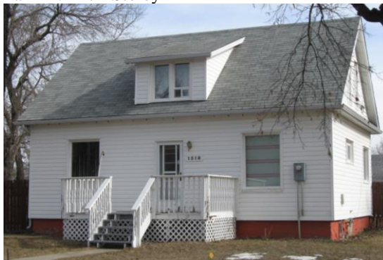
Fair #5: 1 1/2-Storey