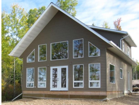
Good #2: 2-Storey