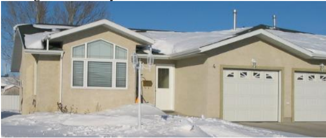
Average #2: 1-Storey Semi-Detached