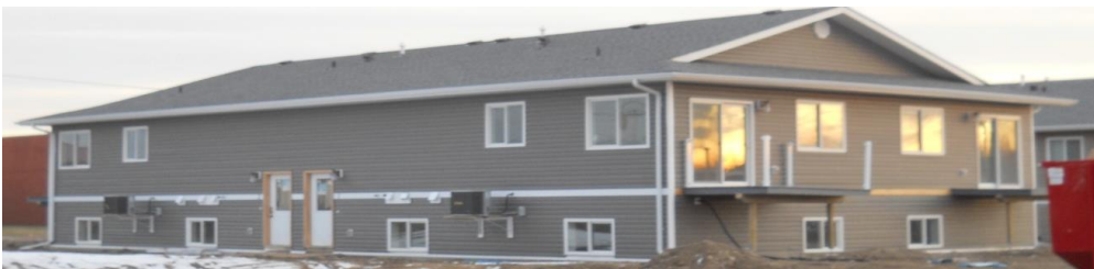
Example 3: Example 3: Eight 2-Storey Townhouses (2 End Rows and 6 Inside Rows)