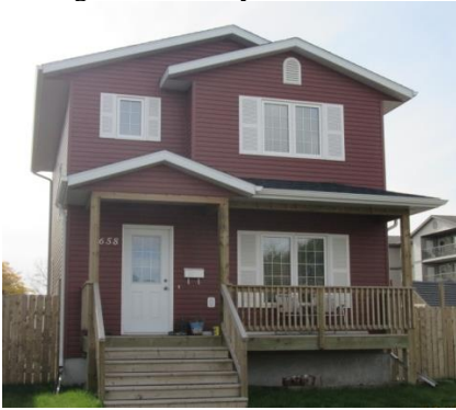
Average #6: Split-Level