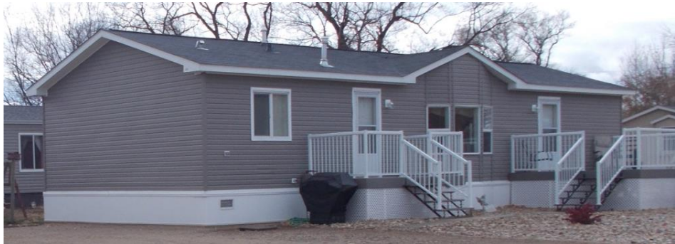
Good #2: 20'x76'