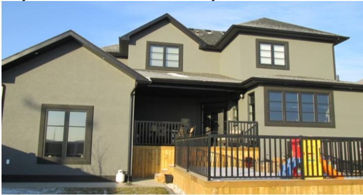
Very Good #5: 2-Storey