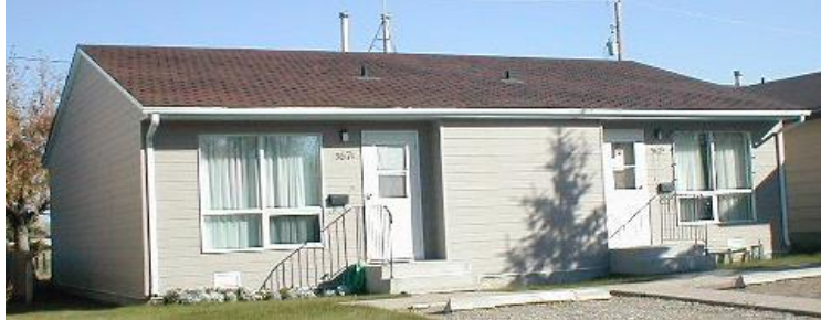
Fair #2: 1-Storey Semi-Detached