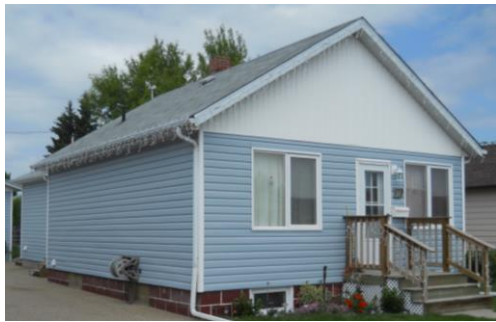
Low #3: 1-Storey