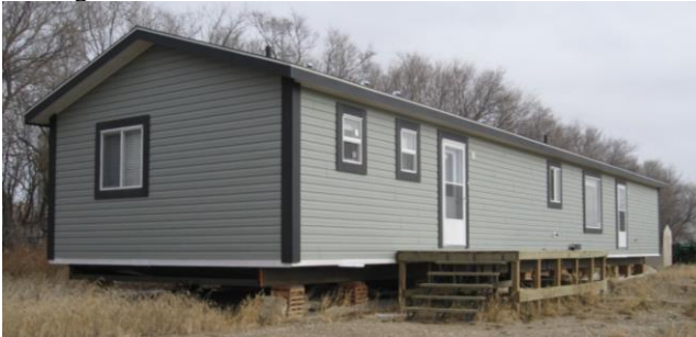
Average #2: 14'x76'