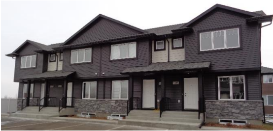
Example 1: Four 2-Storey Townhouses (2 End Rows & 2 Inside Rows)