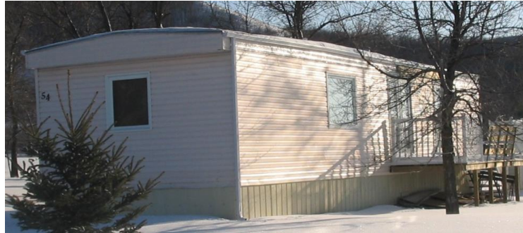
Fair #2: 12'x48'