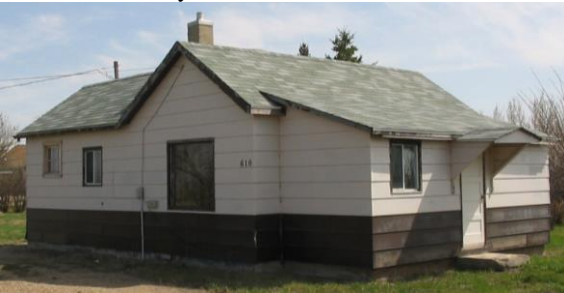
Low #4: 1-Storey