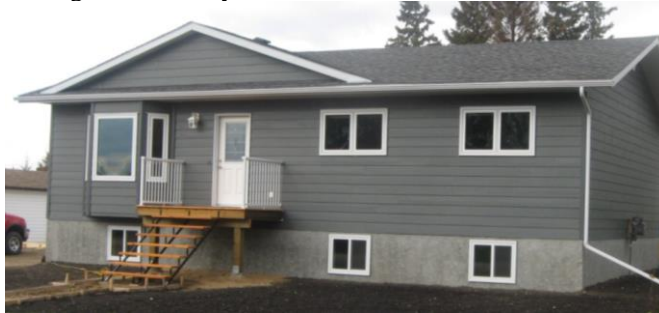
Average #3: Bi-Level