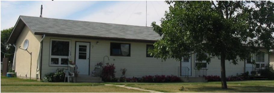
Fair #2: 1-Storey Townhouse - 2 End Rows & 4 Inside Rows