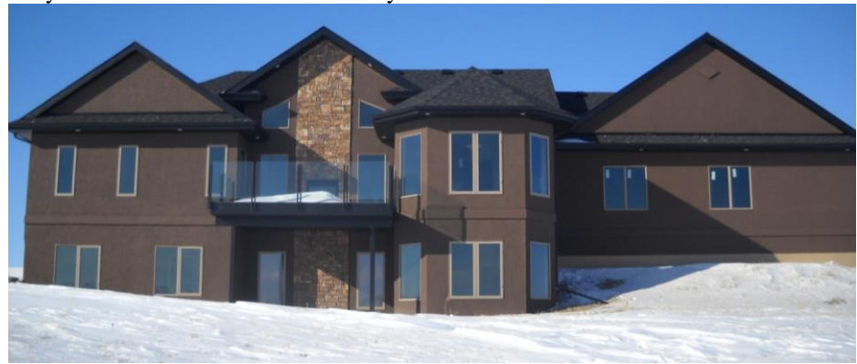
Very Good #3: 2-Storey