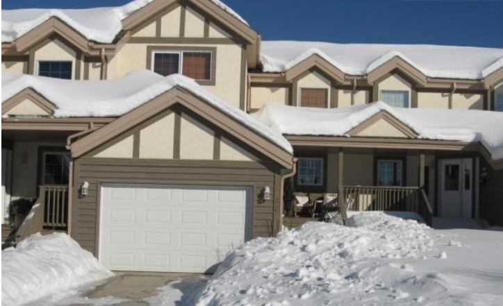
Very Good #1: 2-Storey Townhouse