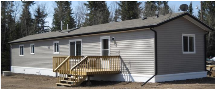
Average #3: 16'x76'