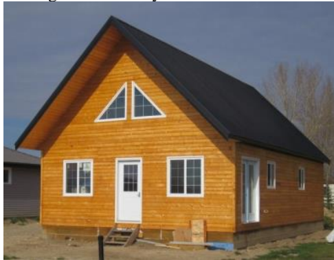
Average #1: 1-Storey