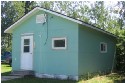
Very Low #2: 1-Storey