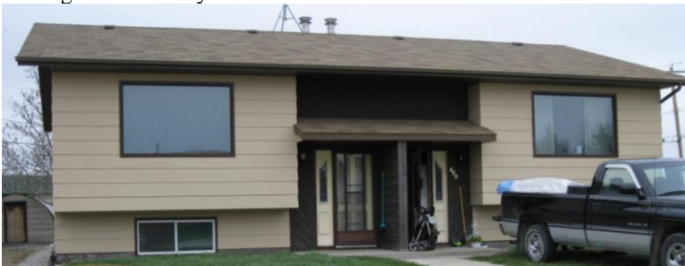
Average #3: 2-Storey Semi-Detached