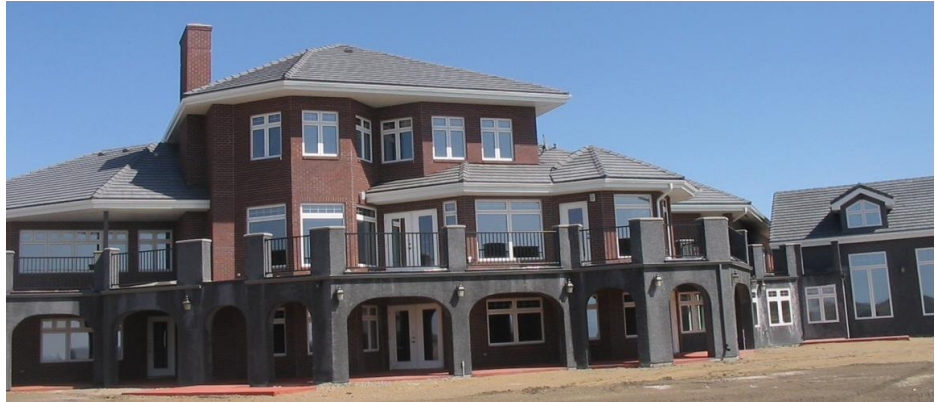
Excellent #2: 2-Storey