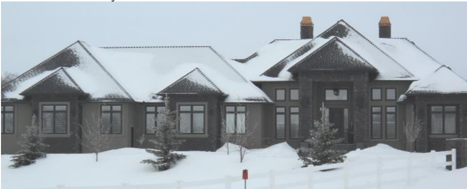
Excellent #4: 1-Storey Hillside