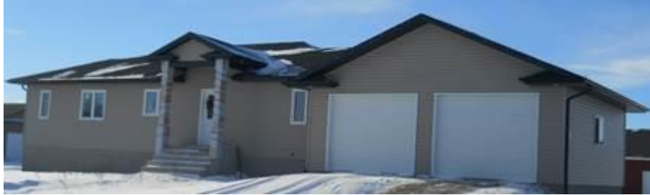
Average #2: 1-Storey