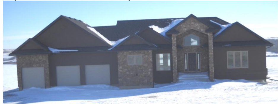
Very Good #2 - rear elevation: 1-Storey Hillside