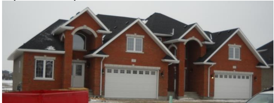
Very Good #1: 2-Storey Semi-Detached