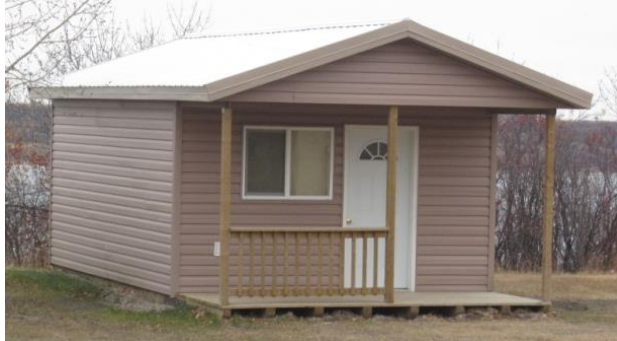
Low #2: 1-Storey