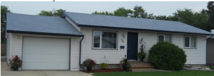
Fair #2: 1-Storey