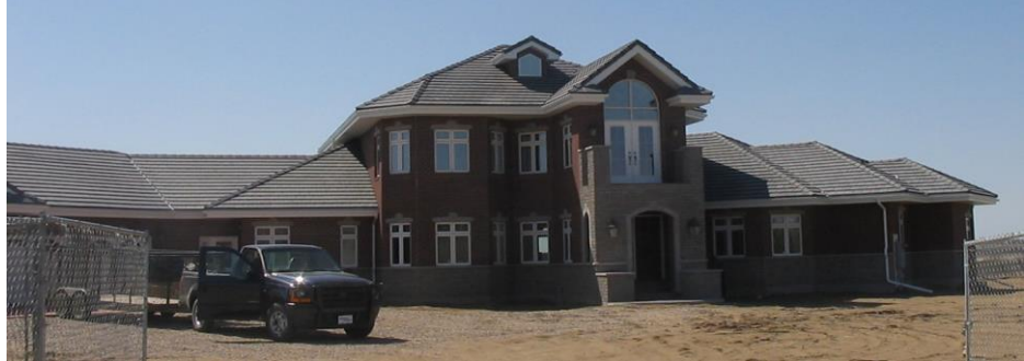
Excellent #1 - rear elevation: 2-Storey Hillside