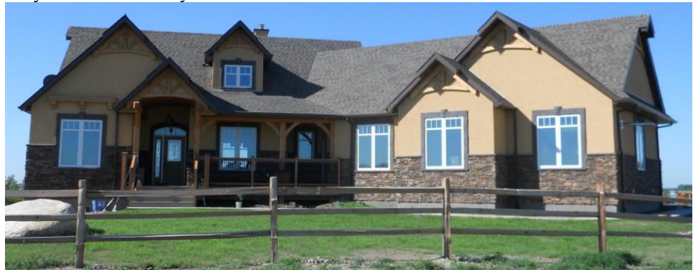
Very Good #6: 1-Storey