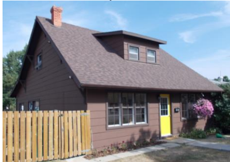
Fair #4: 1 1/2-Storey