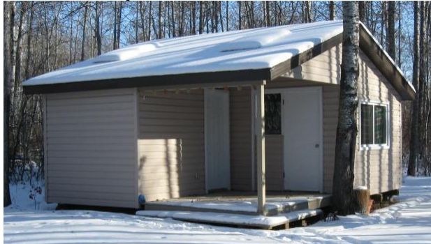
Low #3: 1-Storey