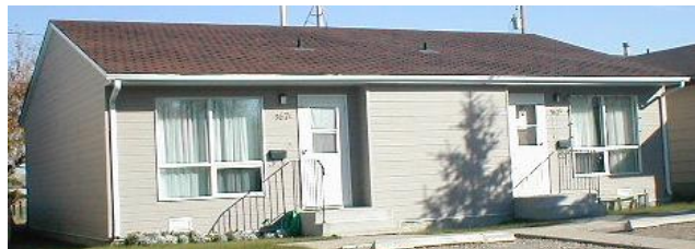
Example 1: Two 1-Storey Semi-Detached (2 End Rows)

A multi-family residential building divided into two family living units, with a common wall between the units and separate entry, electrical, plumbing and heating systems. Each semi-detached unit is an End Row.