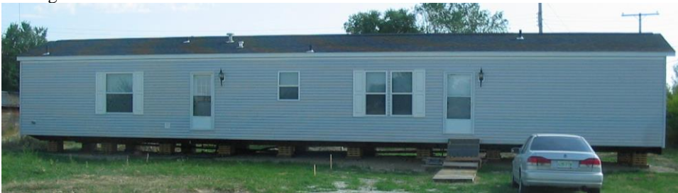
Average #4: 20'x76'