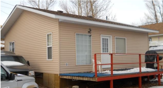
Fair #2: 1 1/2-Storey